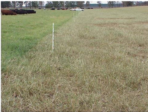
Figure 1. Stockpiled 'Tifton-85' bermudagrass on Thanksgiving weekend 2004 in a study at the Southwest Georgia Research and Education Center near Plains, GA. Note that the light colored strip on the right has been grazed for 3 days and the cattle on the left have just been allocated a new strip. In this study, the utilization of bermudagrass was calculated to be 74% (daily intake = 2.23% of body weight).

Researchers have determined after many years of experiments in Georgia and other states in the southeastern U.S. that stockpiling bermudagrass is a cost-effective strategy to provide winter forage needs (Figures 1 and 2). Economic analyses have consistently shown that stockpiled bermudagrass can be fed for 33-60% of the cost of making and feeding bermudagrass hay made from the same farm (Lalman et al., 2000).